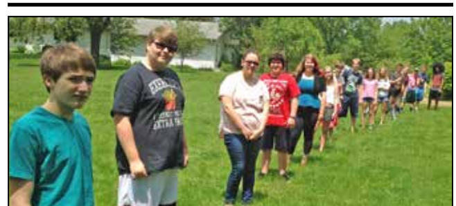
Why are the SCYL teens lined up just so? See page 88.

Swedenborg had become somewhat controversial by the end of his life. He was still involved in an unresolved