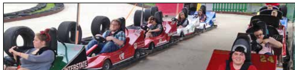
The teens getting ready to race!