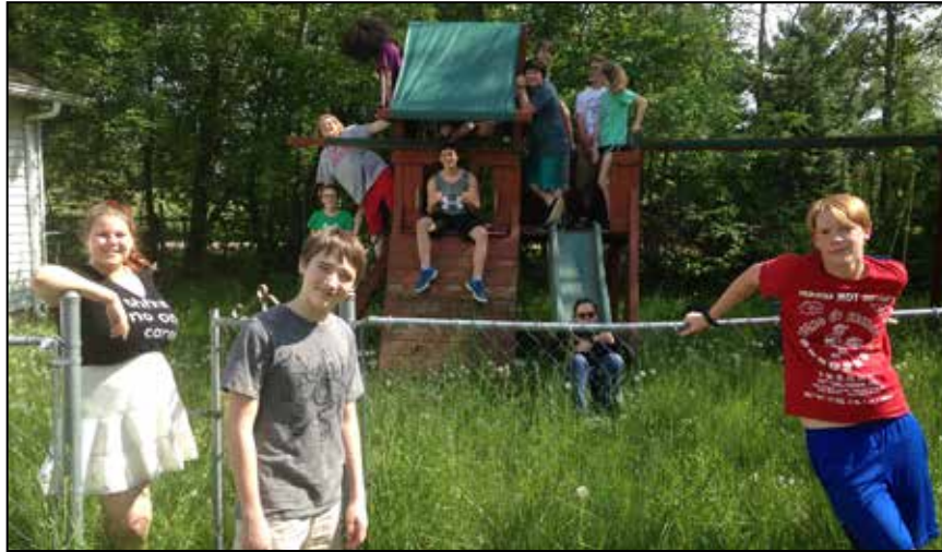
The SCYL gang (Page 81 photo: The teens line up for a privilege walk.)

that was diverse. The list was extensive and included lots of examples from nature such as flowers, rocks, and trees. The teen list also included interesting examples of diversity in stars, poetry, personalities, mental disorders, and tacos! Renée then went on to explain why diversity exists. She told the group that diversity exists so that love can happen. “Love has to love and care for that which is differ-