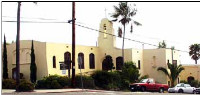
The San Diego Church

What is the New Jerusalem? Well for Swedenborg, who came to believe that the Bible has an inner meaning, beyond its literal meaning, the New