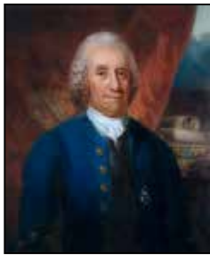
Emanuel Swedenborg by Carl Fredrik von Breda

There are approximately seven Swedenborgian denominations internationally with a total membership of 50,000, the largest groups being in West Africa and South Africa. The American Swedenborgian Church of North America (incorporated as the General Convention of the New Jerusalem) is the second oldest, after the English movement. All Swedenborgian