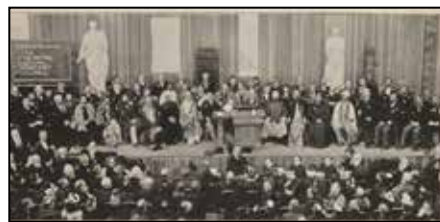
The first Parliament of the World’s Religions for the 1893 Columbian Exposition, in Chicago

There has long been a commitment in the Swedenborgian Church of North America to ecumenical and pluralist relations. A Swedenborgian, Charles Carroll Bonney, conceived of the first Parliament of the World’s Religions for the 1893 Columbian Exposition in Chicago, and he presided over