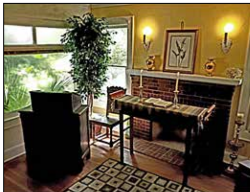
Recently Transformed Worship Space at Chrysalis Retreat Center